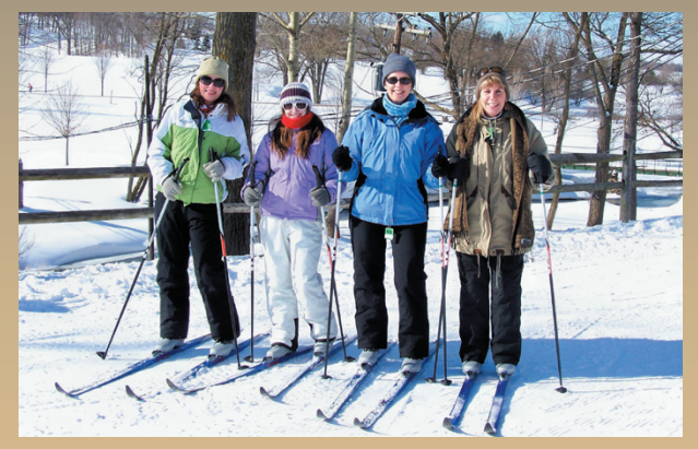
Cross country skiing is fun for the whole family! Child and adult rental equipment is available.

To make reservations, call 585-535-7300. For updated ski and snowmobile trail conditions, upcoming events, and entertainment go to www.byrncliff.com. You can be part of the action too by contributing to our online SnowBlog.